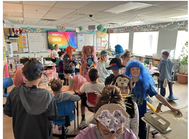
Wacky Hair / Hat Day