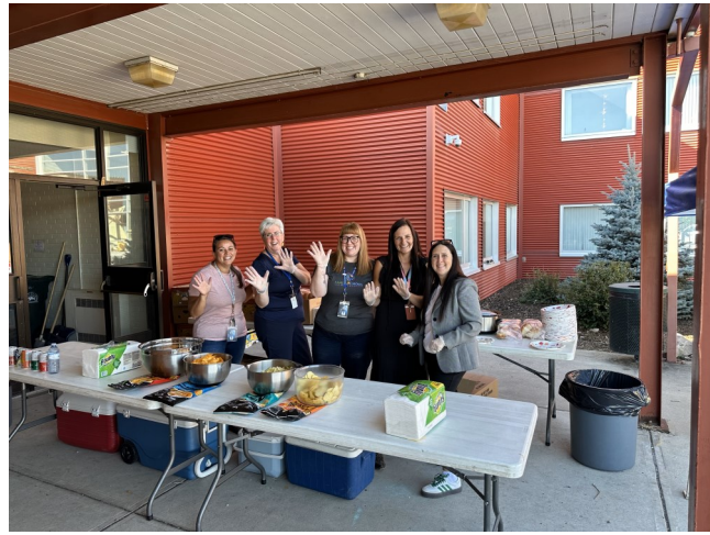
Serving up some great BBQ at the RVS Welcome Back Open House