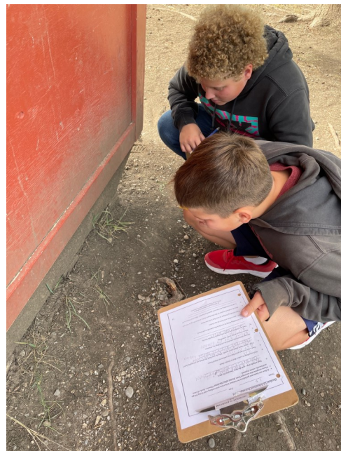
Gr 7B studying biotic and abiotic factors on the playground