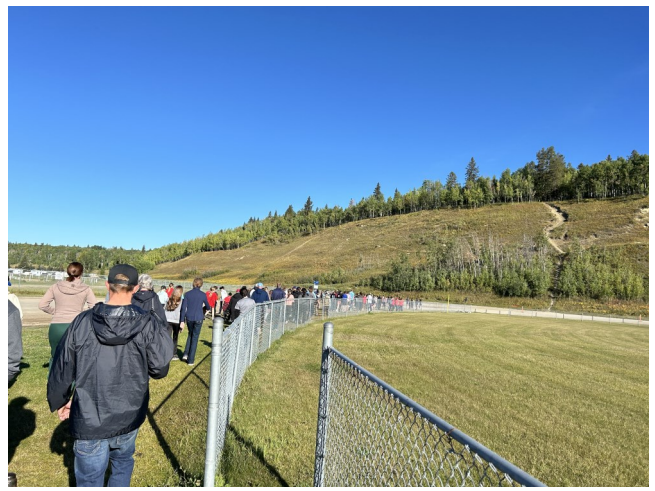
Under an exceptionally blue Alberta sky River Valley School hosted the CESD Fun Run for Gr 7 to 12 from across the CESD school division