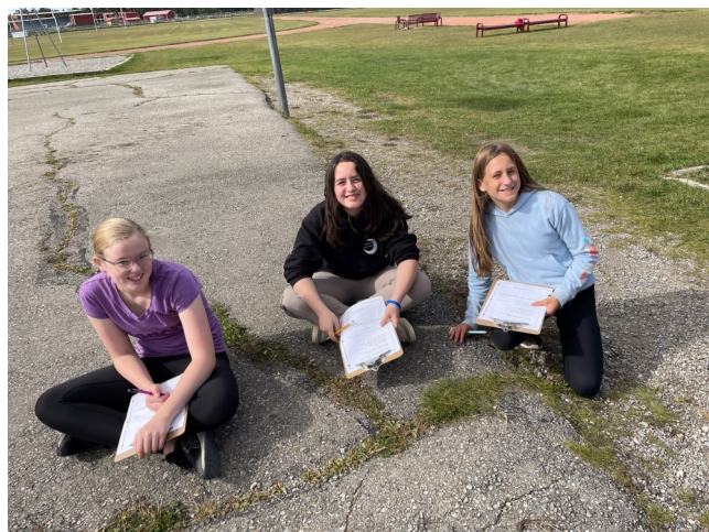
Gr. 5A Science Experiment