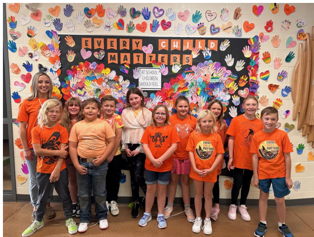
Orange Shirt Day